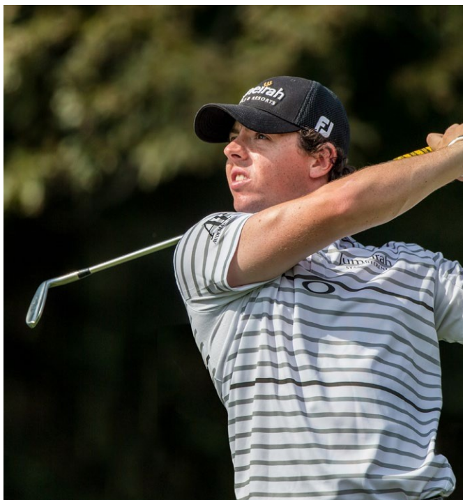
Rory McIlroy hits a shot on Bethpage Black at the Barclays. Farmingdale, NY. August 21, 2012

To add more history to the occasion, this year's event will be held at St Andrews in Scotland, long thought of as golf's spiritual home.