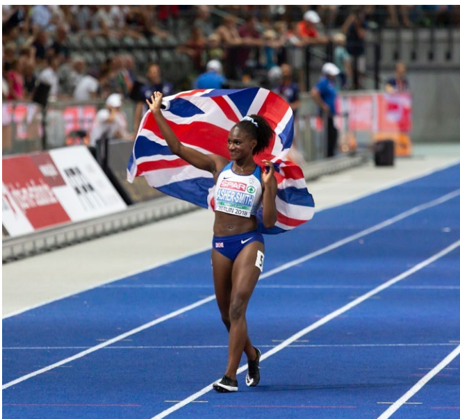
Dina Asher-Smith at the 2018 European Athletics Championships. Berlin, Germany. 7th August 2018

There will be 19 different sports, attracting world-class competitors from 72 different nations.