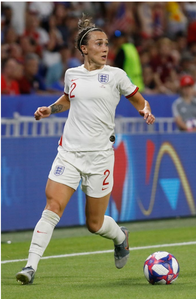
Lucy Bronze during the FIFA Women's World Cup France 2019 semi-final football match England vs USA. Groupama Stadium, Lyon, France. 2nd July 2019

16 teams will compete over a 25-day period, with the final at Wembley on the last day of July.