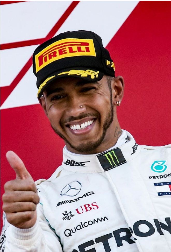
Lewis Hamilton, Mercedes, celebrating his victory on the podium. F1 World Championship 2018. Barcelona, Spain. 13th May 2018

Lewis Hamilton clearly likes it, having won a record eight Grand Prix held there.