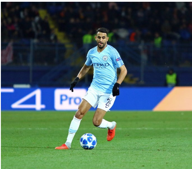
Riyad Mahrez of Manchester City during the UEFA Champions League game against Shakhtar Donetsk. Kharkiv, Ukraine. 23rd October 2018

There's also unanimous optimism. Every team – from the Premiership down to non-league level – starts with a clean slate, which all adds to the atmosphere of hope and anticipation.