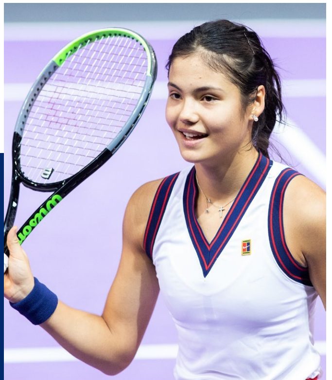
Emma Raducanu in action during a match at WTA Transylvania Open International Tennis Tournament. Cluj-Napoca, Romania. 25 October 2021

The Wimbledon website is a good source of ticket and event information.