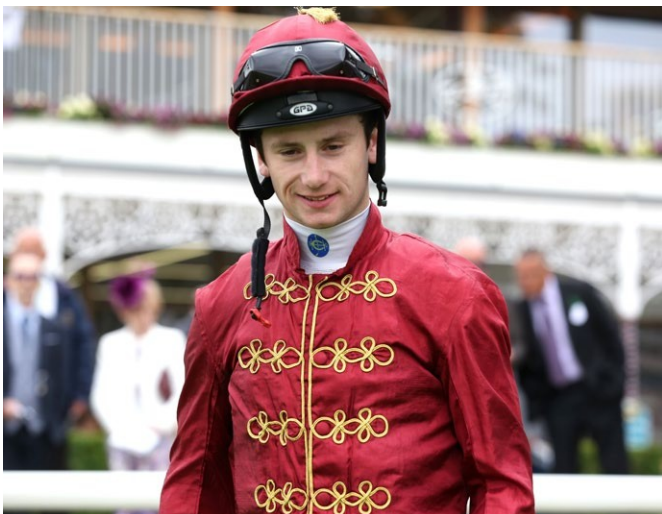
Jockey Oisín Murphy in the colours of Qatar Racing at York Racecourse The Knavesmire, York Racecourse, North Yorkshire, UK. 15 June 2018

The “royal” soubriquet comes from the fact that royalty have made a point of visiting, given that Ascot is just down the road from Windsor Castle and the royals’ long-term affinity with horse racing.